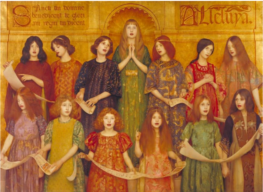
Alleluia by Thomas Cooper Gotch