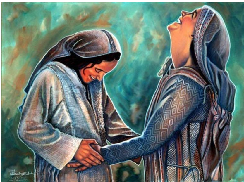
Jump for Joy