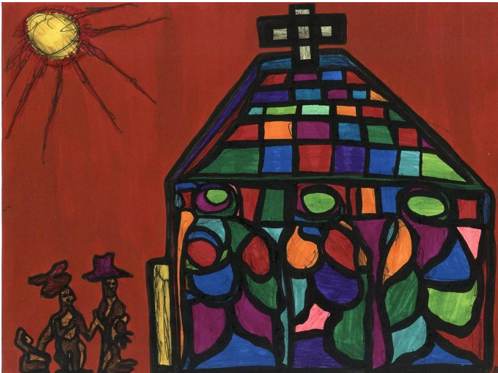
Call to Worship - Darrell Black