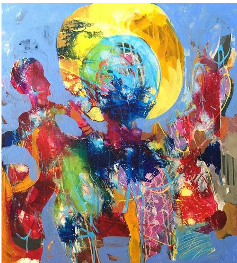
All Saints III by Dariusz Labuszek