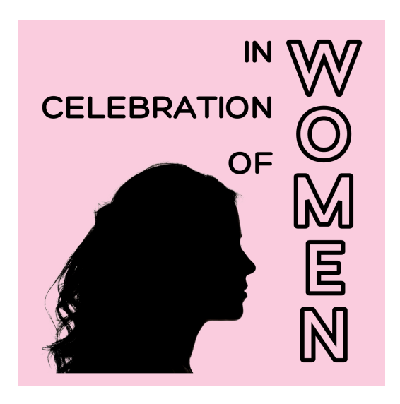
In Celebration of Women Disciples Luke 8:1-3