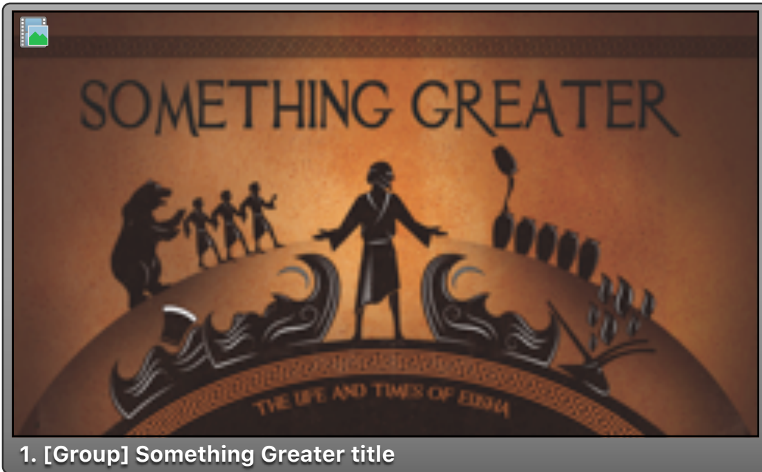
1. [Group] Something Greater title