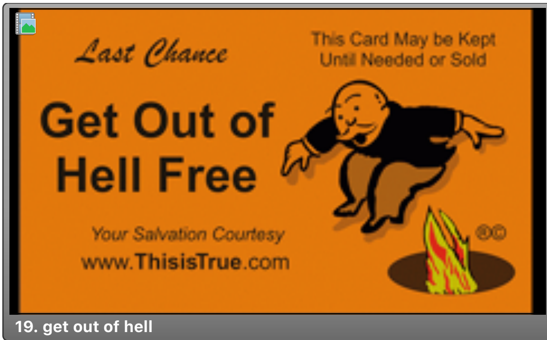
19. get out of hell