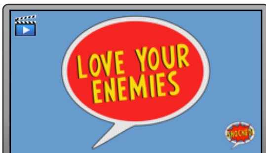
7. Love Your Enemies Logo