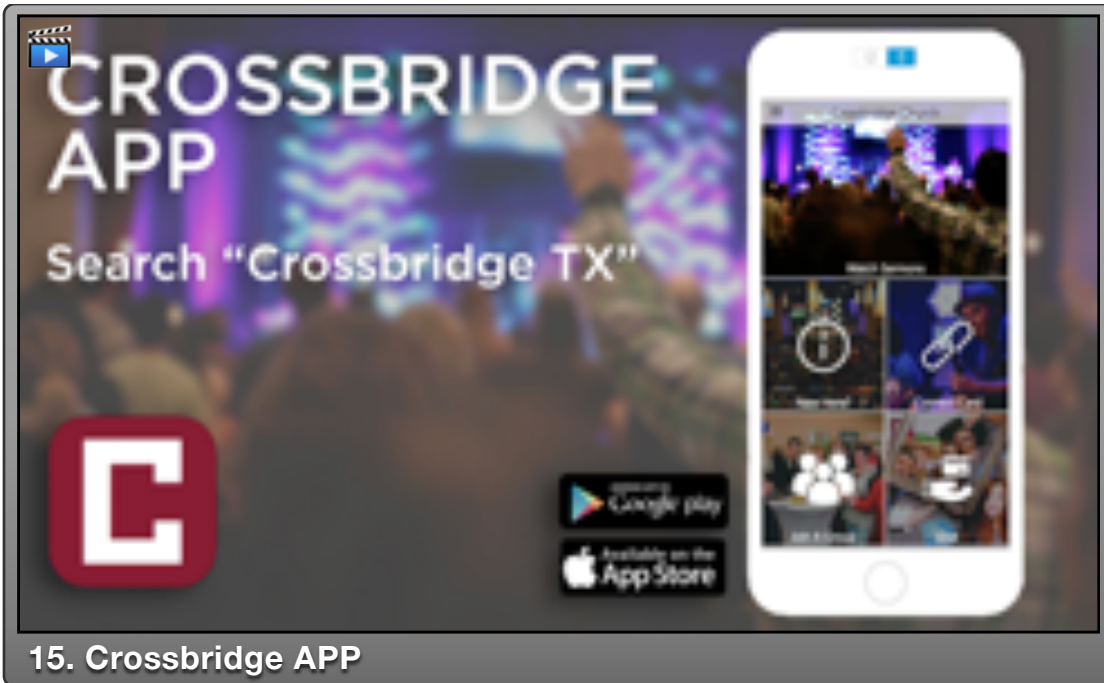
15. Crossbridge APP