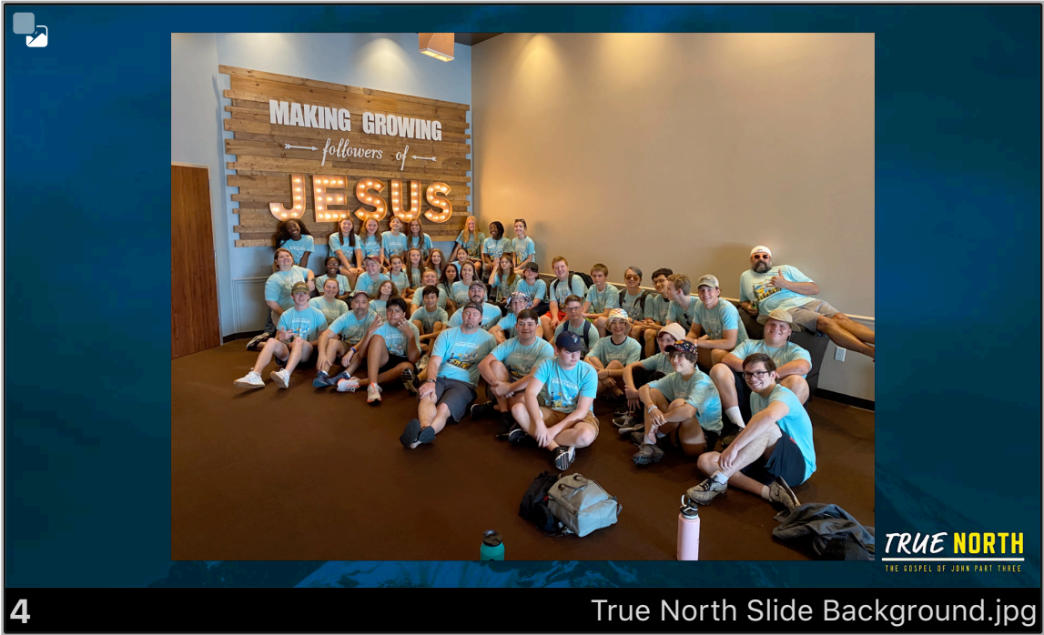
True North Slide Background.jpg