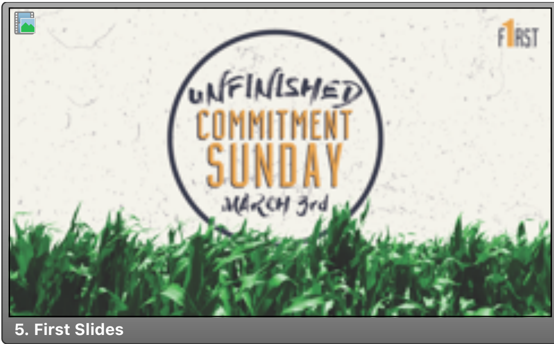
5. First Slides