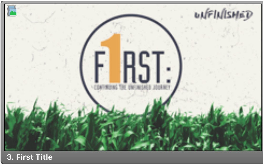
3. First Title