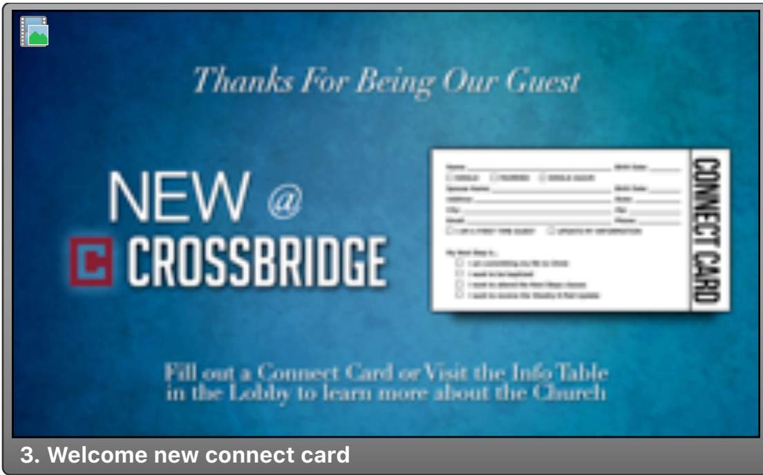
3. Welcome new connect card