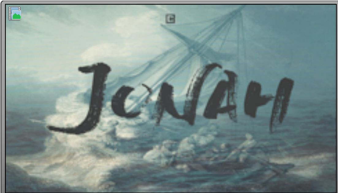
7. JONAH 1080P title