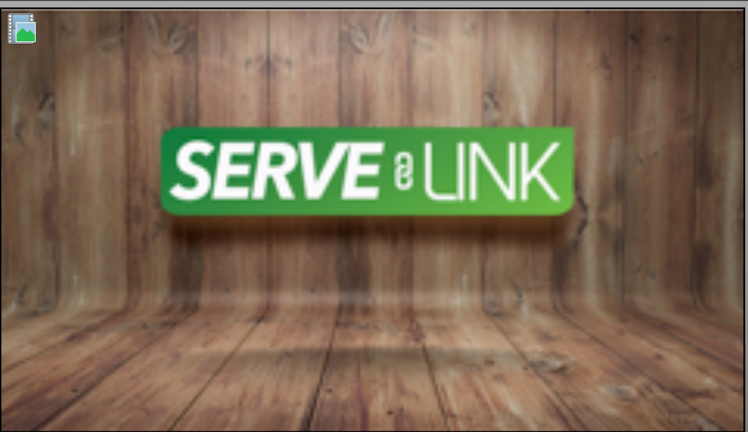
27. Serve Link