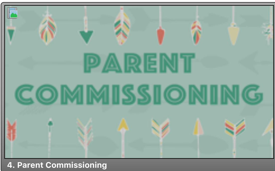
4. Parent Commissioning