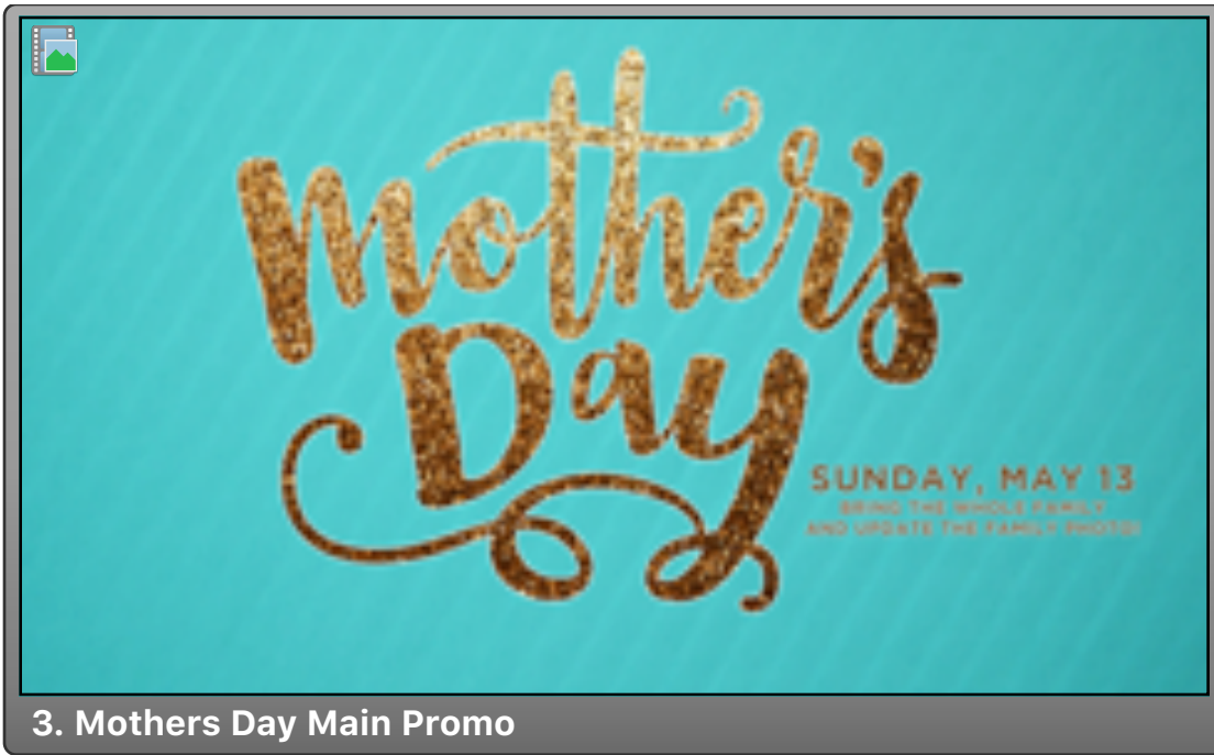
3. Mothers Day Main Promo