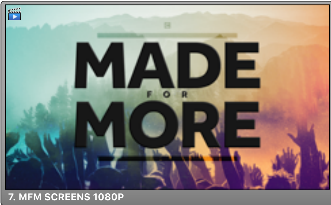
7. MFM SCREENS 1080P