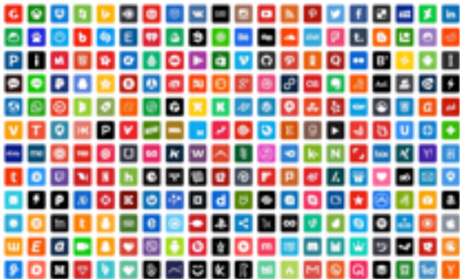
16. Connexus Takeover.016