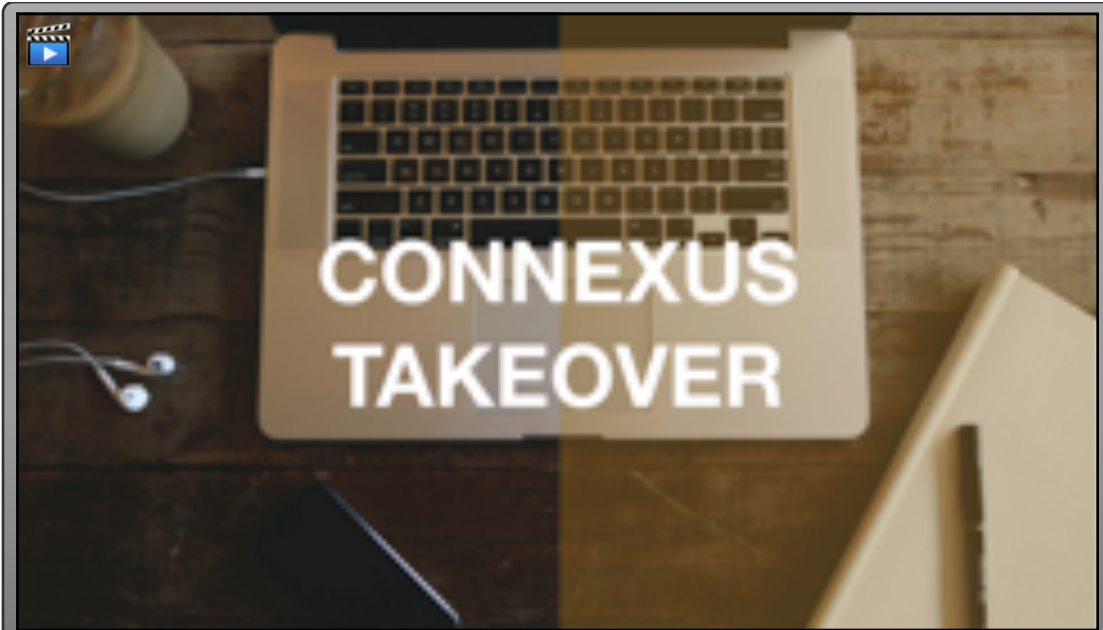
25. Connexus Takeover.022