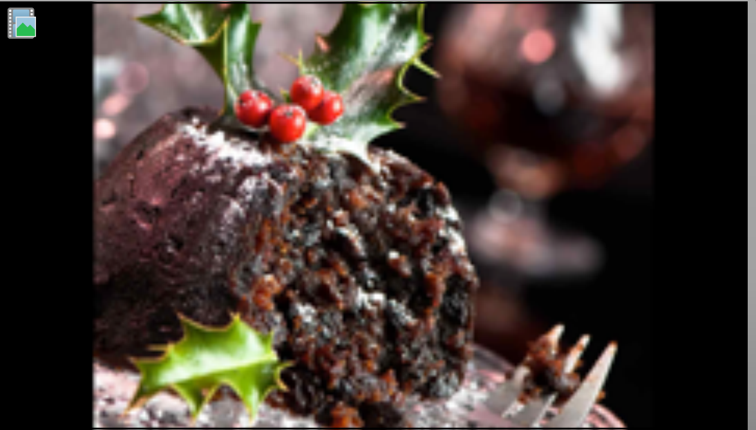
3. figgy pudding