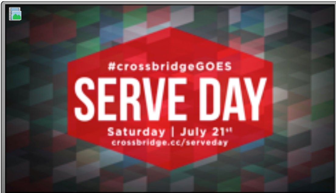
9. Different Slides