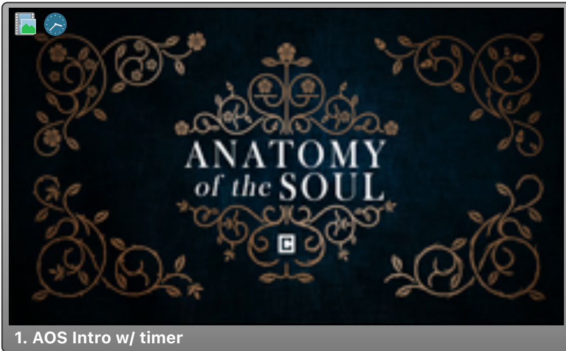
1. AOS Intro w/ timer