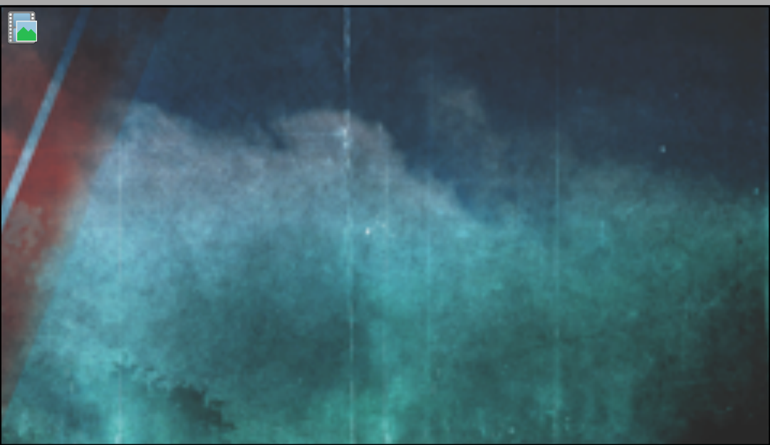
1. [Group] countdown