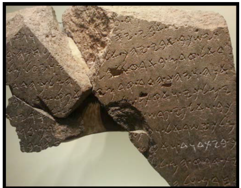
VICTORY MONUMENT SET UP BY HAZAEL AT TEL DAN