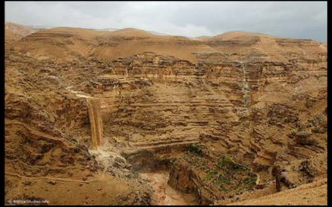
NORTHERN SINAI DESERTS SOFT LIMESTONE