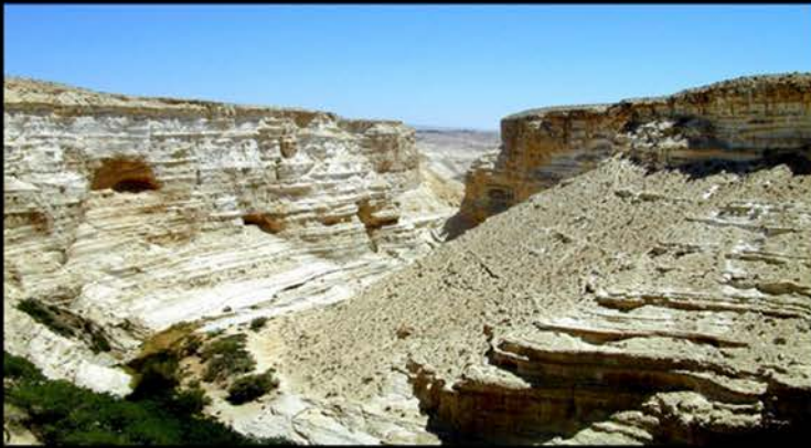
NACHAL TSIN IN WILDERNESS OF ZIN (LOCATION WHERE MOSES STRUCK THE ROCK)