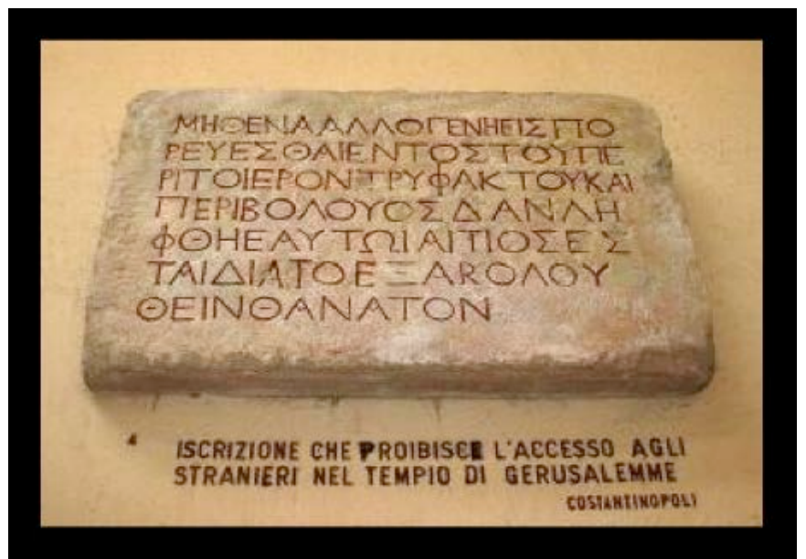
4 ISCRIZIONE CHE PROIBISCE L'ACCESSO AGLI STRANIERI NEL TEMPIO DI GERUSALEMME COSTANTINOPOLI

“No foreigner is to enter within the fence/railing around the sanctuary and the enclosure. Whoever is caught, on himself shall be put the blame for the death which will ensue.”