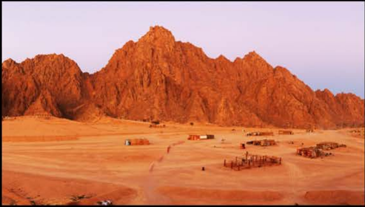
SOUTHERN SINAI DESERTS HARD GRANITE