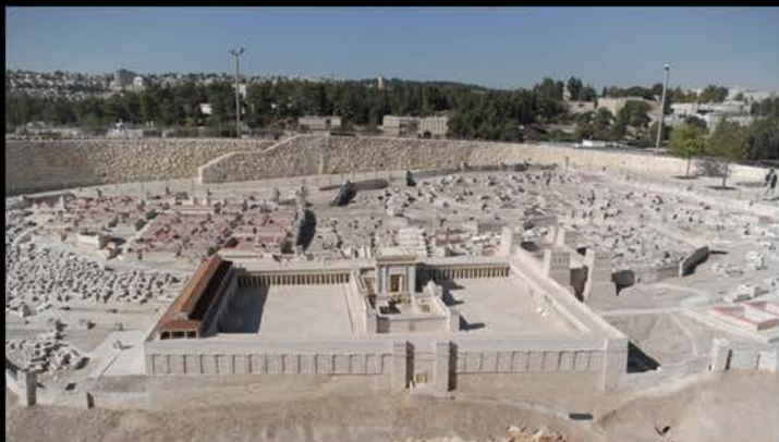
MODEL OF THE CITY OF JERUSALEM, DURING JESUS'S TIMES