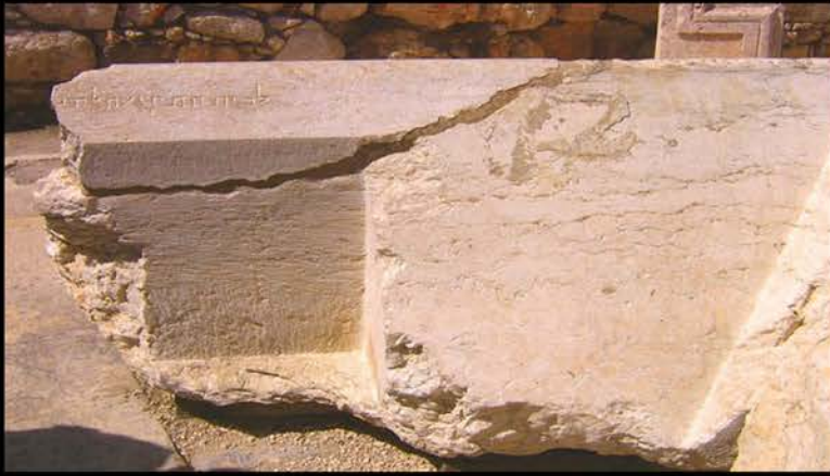
ANCIENT ROAD SIGN "PLACE OF BLOWING"