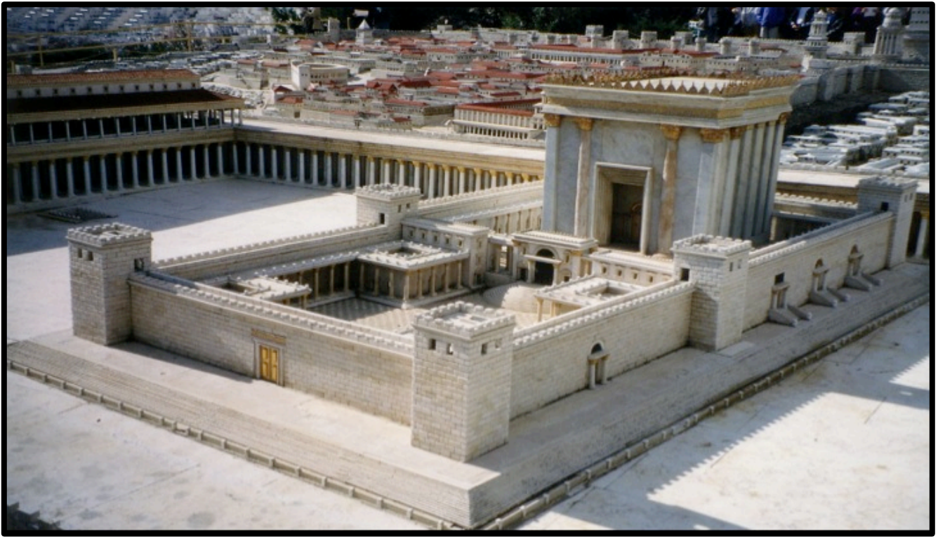
THE HOLY PLACE

Proceeding across [the Court of the Gentiles] toward the second court of the temple, one found it surrounded by a stone barrier , three cubits high and of exquisite workmanship. In this at regular intervals stood slabs giving warning, some in Greek, others in Latin characters, of the law of purification, that no foreigner was permitted to enter the holy place, for so the second enclosure of the temple was called.