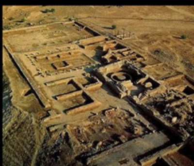
HERODIAN JERICO - NEW TESTAMENT