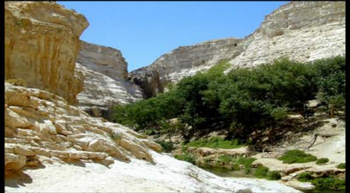
WATER SEEPAGE CHANGES COLOR OF THE ROCKS