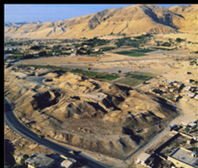
ANCIENT JERICO FROM JOSHUA/ OLD TESTAMENT

“And it came about that as He was approaching Jericho...”