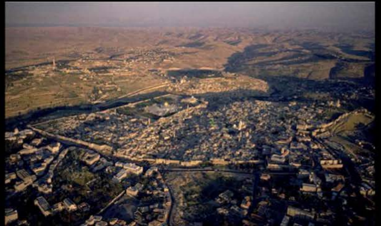
TEMPLE MOUNT EVIDENCE OF HISTORICAL ACCOUNT