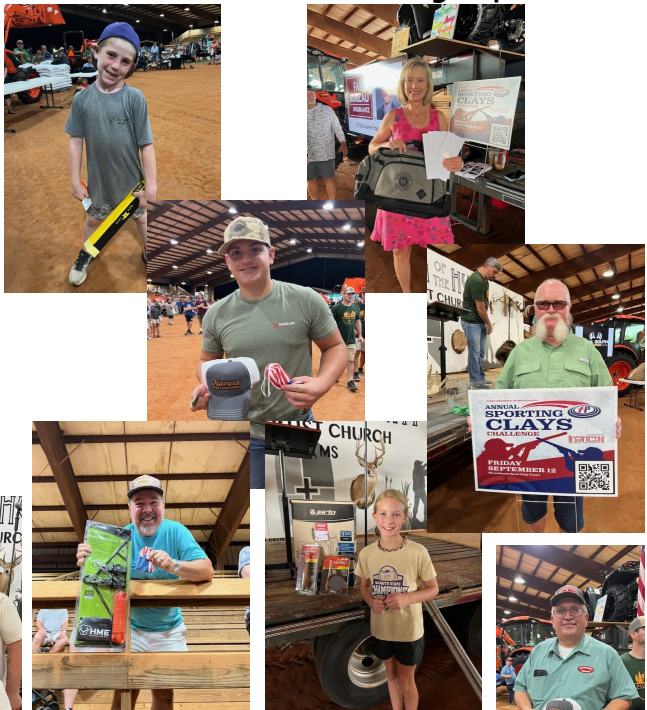
More Door Prize Winners