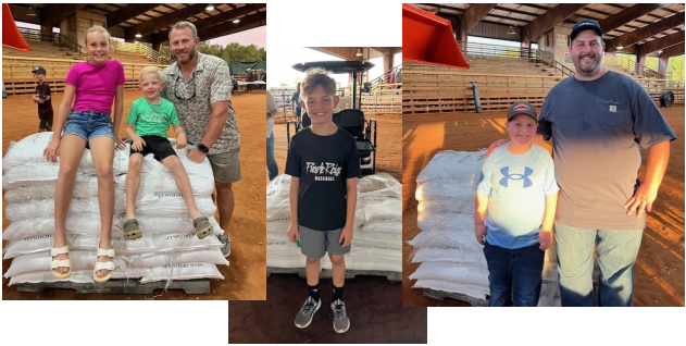
A Few Winners of Corn