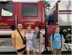
Life Saver Night