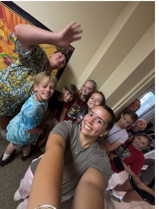
VBS - Wonder Junction