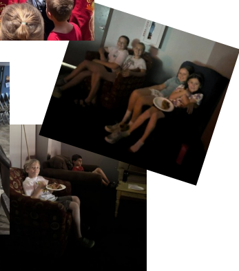
Pizza & Movie Day