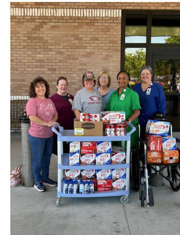
The "Joy" Sunday School class making a delivery to the cancer center in Hattiesburg