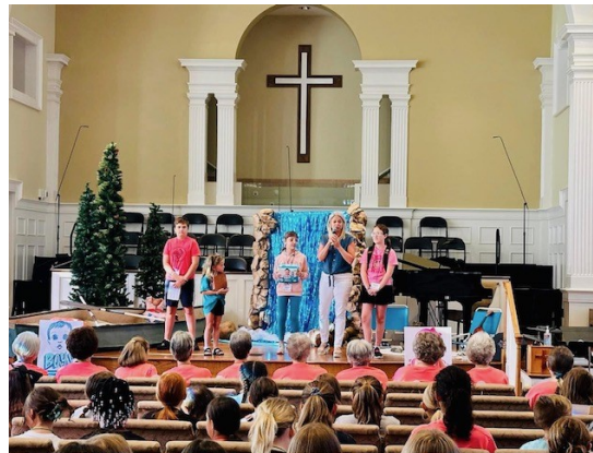
VBS 2024 Breaker Rock Beach