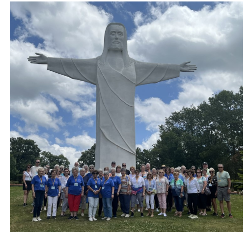
The senior adults' trip to The Passion Play in Eureka Springs, AR