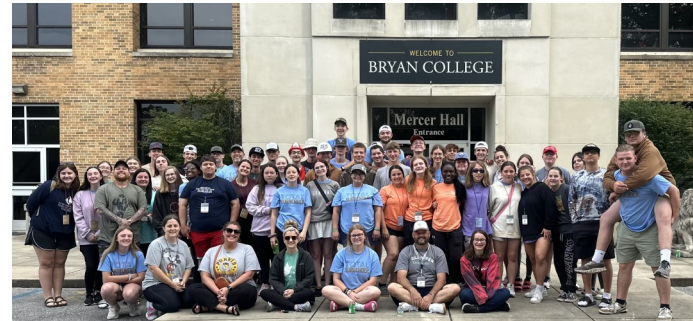
FBC Purvis Youth at camp - Generate