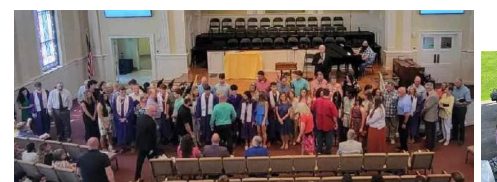
Praying Over Our High School Graduates