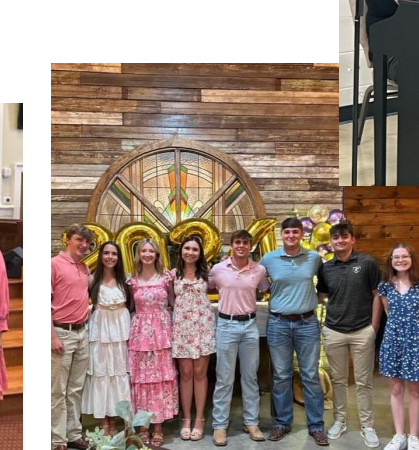
Dinner with some of our graduating seniors