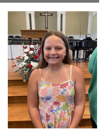
Harper June Camp