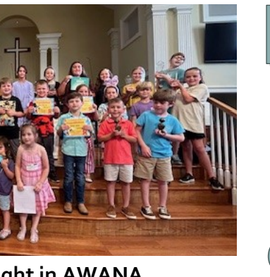
Awards Night in AWANA