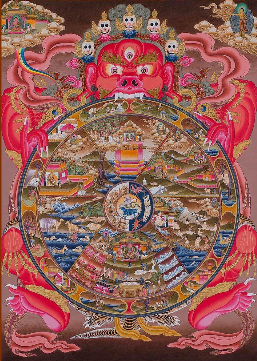
Wheel of Life ( Samsara )