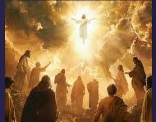
Ascension & return in a body