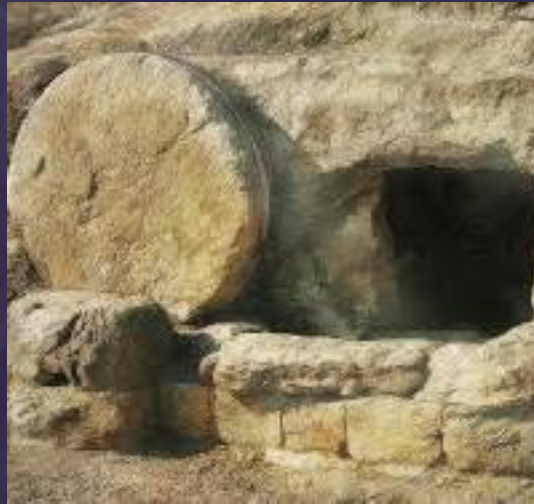
Death & resurrection of a body