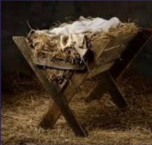
Birth into a body

You are what you expect . . . . . . and Christmas changes everything we expect