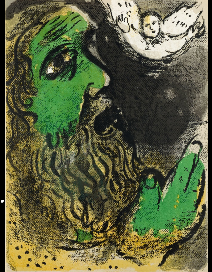
JOB IN DESPAIR - CHAGALL - 1960

—who has hardened himself against him, and succeeded?