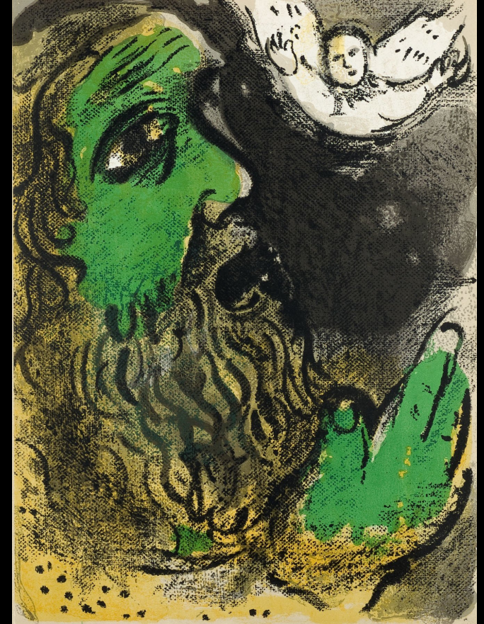
JOB IN DESPAIR - CHAGALL - 1960

Who will say to him, ‘What are you doing?’ ESV