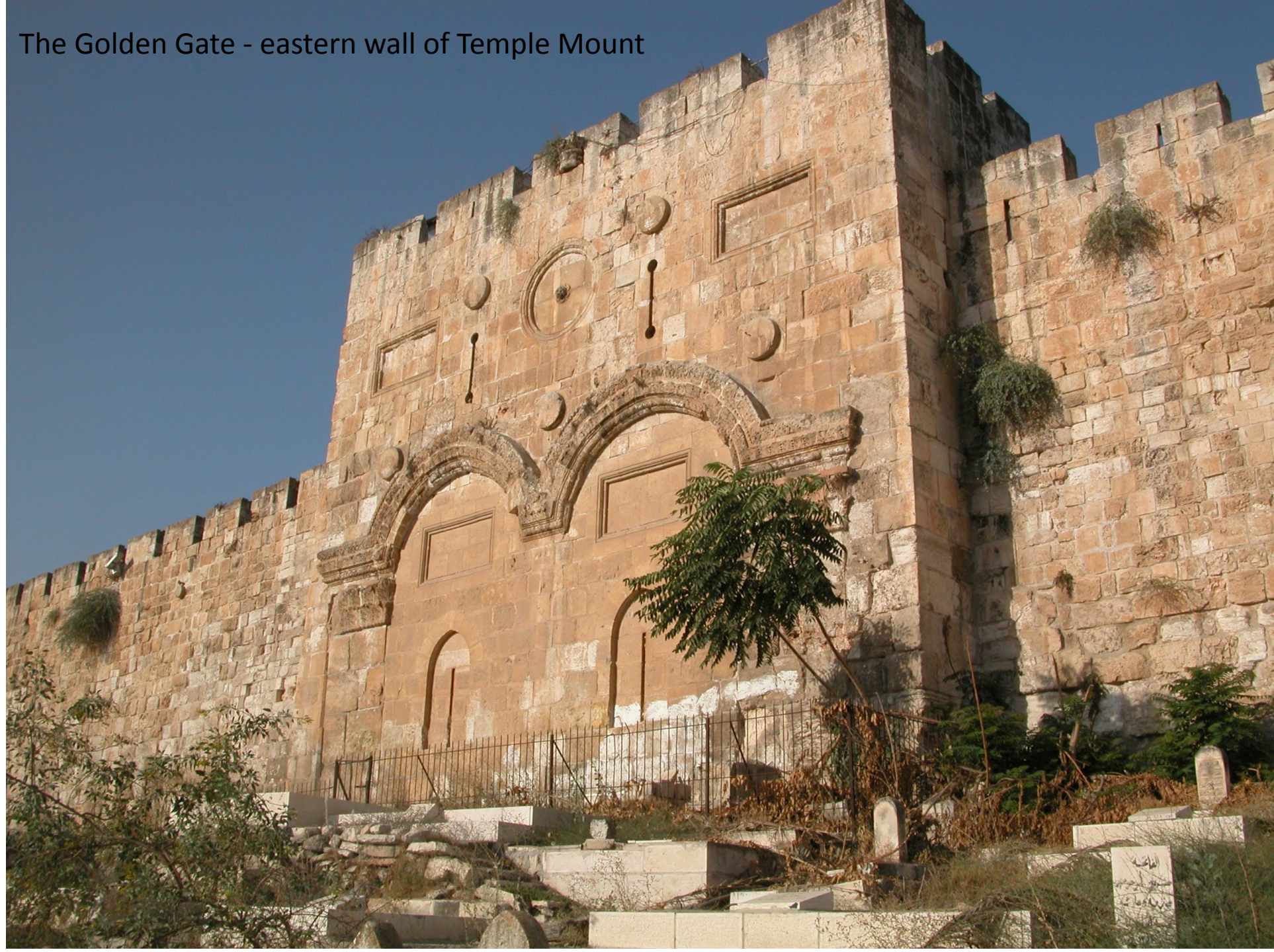
The Golden Gate - eastern wall of Temple Mount