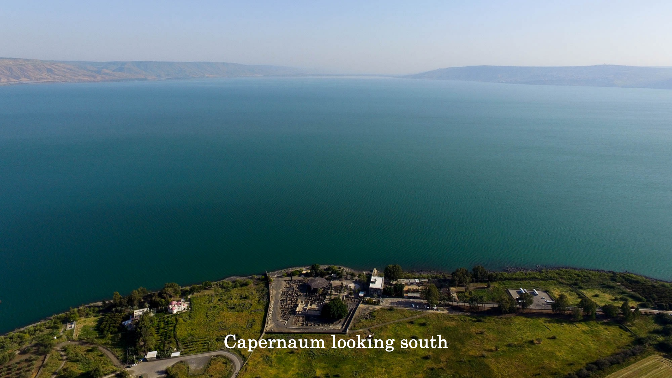
Capernaum looking south