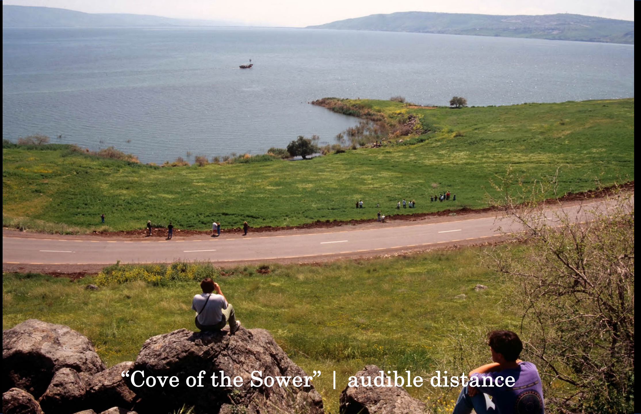
“Cove of the Sower” | audible distance