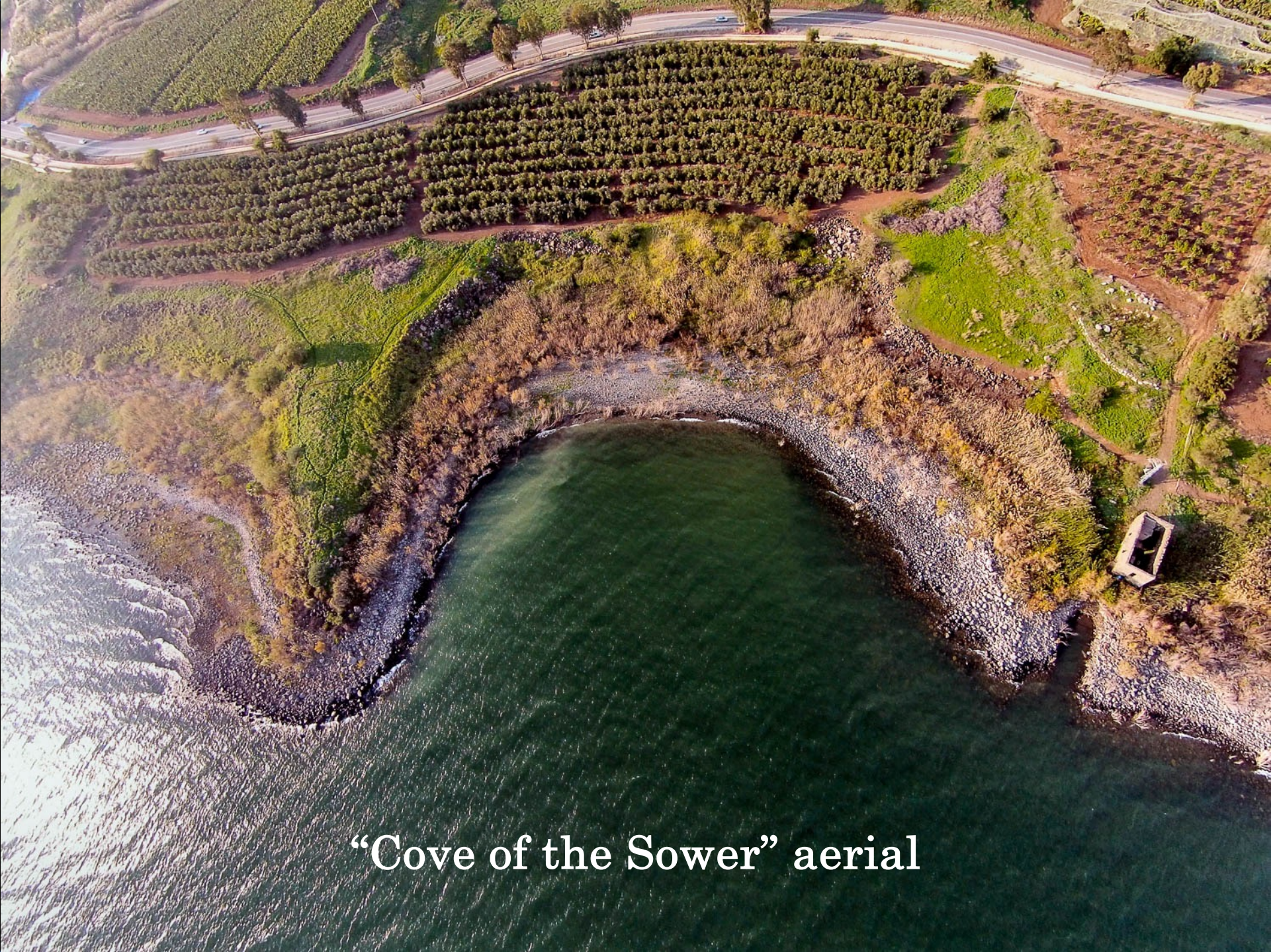
“Cove of the Sower” aerial