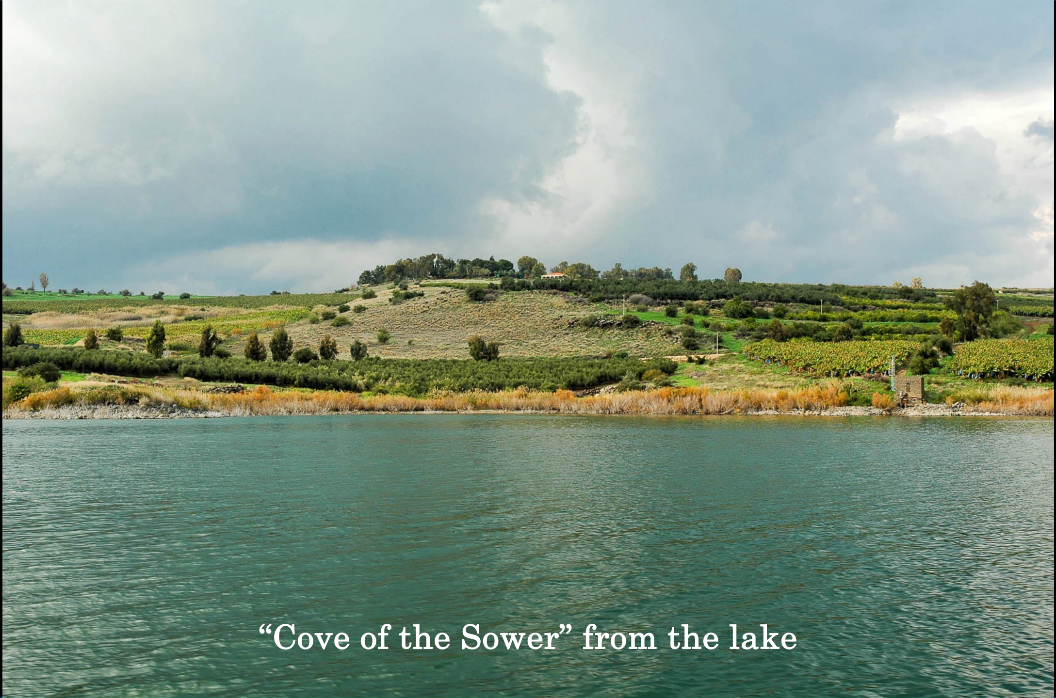
“Cove of the Sower” from the lake