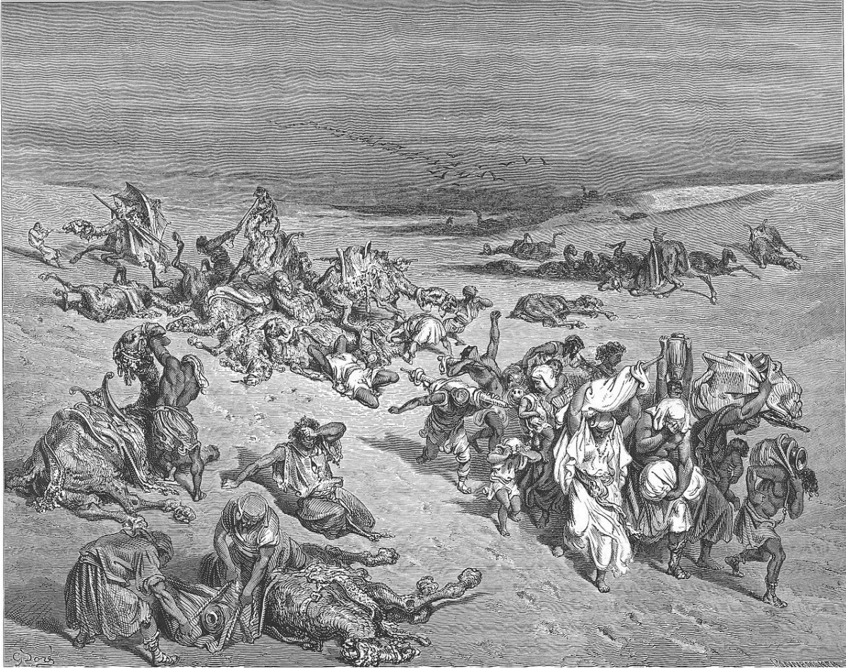
Plague #6 - The Plague of Boils (Exodus 9:8-12)