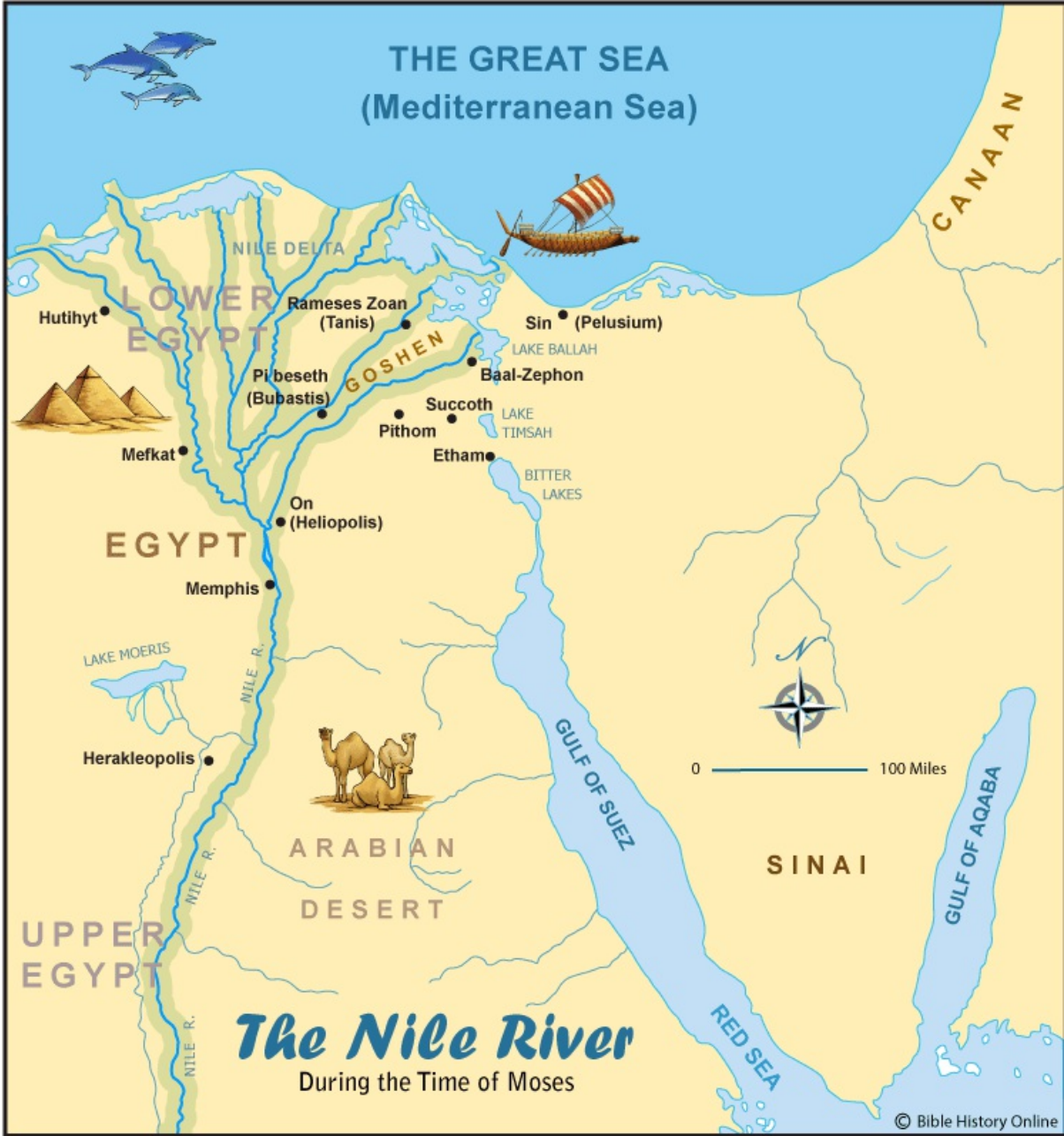
Plague #5 – The Plague on Livestock (Exodus 9:1-7)