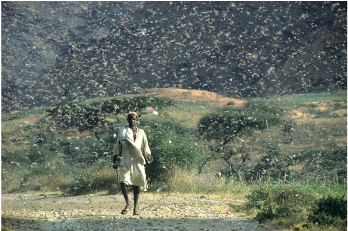
Plague #4 – The Plague of Flies (Exodus 8:20-32)