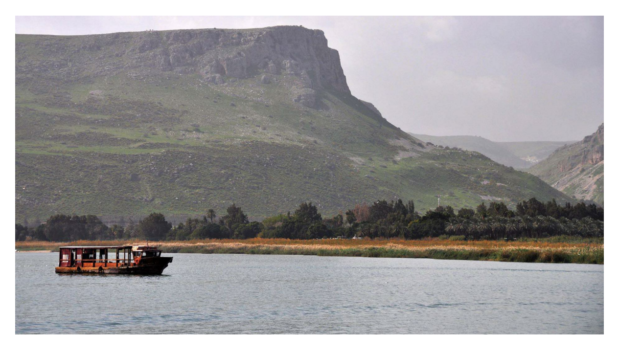
Jesus was sleeping at the back of the boat with his head on a cushion. The disciples woke him up, shouting, "Teacher, don't you care that we're going to drown?" —Mark 4:38 (NLT)

Clearly the disciples are <u>panicked</u>, with even experienced fishermen among them very concerned.