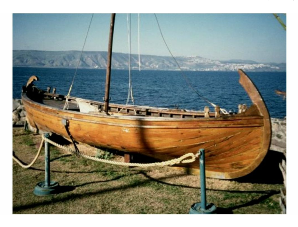
But soon a fierce storm came up. High waves were breaking into the boat, and it began to fill with water. —Mark 4:37 (NLT)