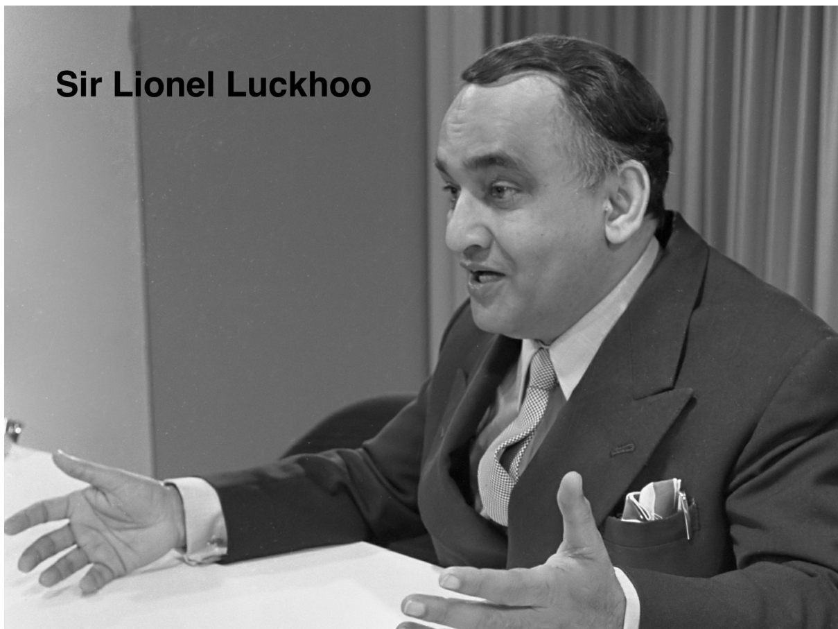
Sir Lionel Luckhoo

The Guinness Book of World Records' "most successful lawyer, who succeeded in getting his 245th consecutive murder acquittal by January 1, 1985" said: