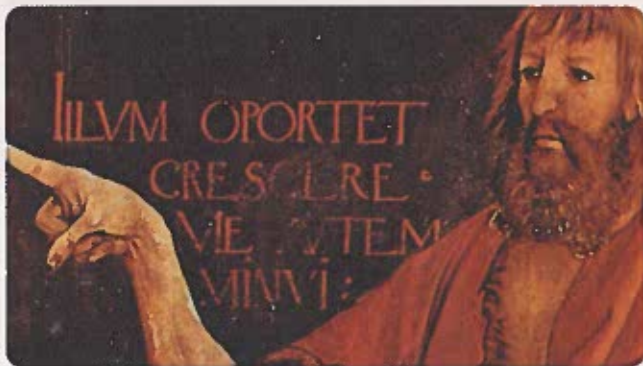
DETAIL OF THE ISENHEIM ALTARPIECE BY MATTHIAS GRÜNEWALD