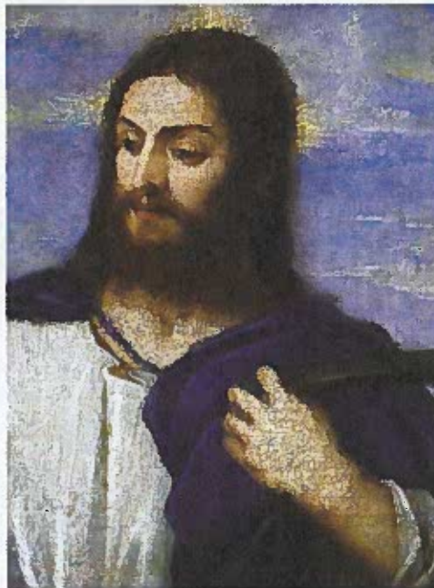
CHRIST AS THE GARDENER (DETAIL), TITIAN