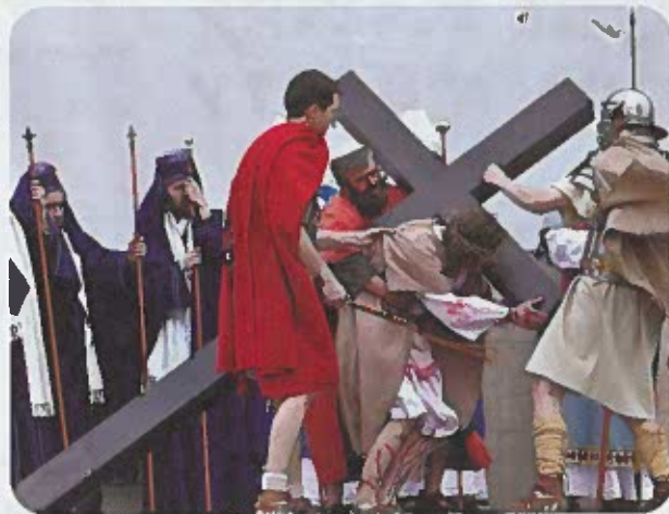
GORA KAUWARRA, POLAND / STANISLAW TOKARSKI / SHUTTERSTOCK