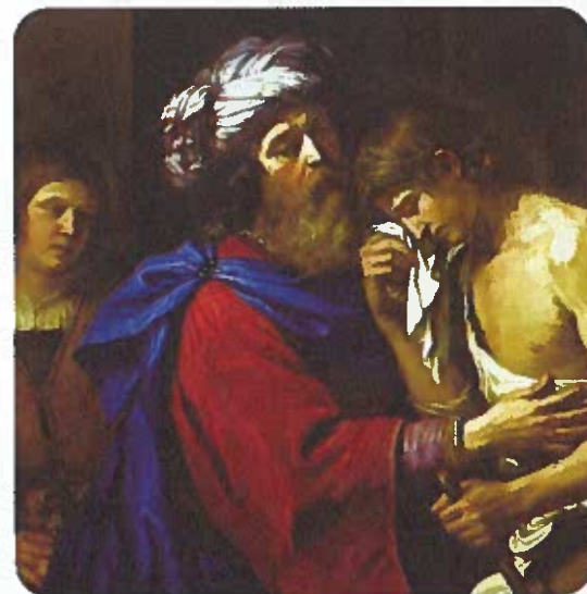
RETURN OF THE PRODIGAL SON, GUERCINO