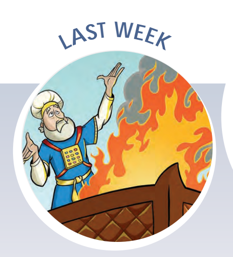
A Sinful People Approaching a Holy God Leviticus Summary

Story of the Bible Chart picture of the day: