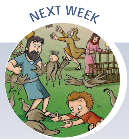
Preparing to Take the Land Numbers 1-12