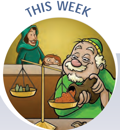
Blessings and Curses Leviticus 26