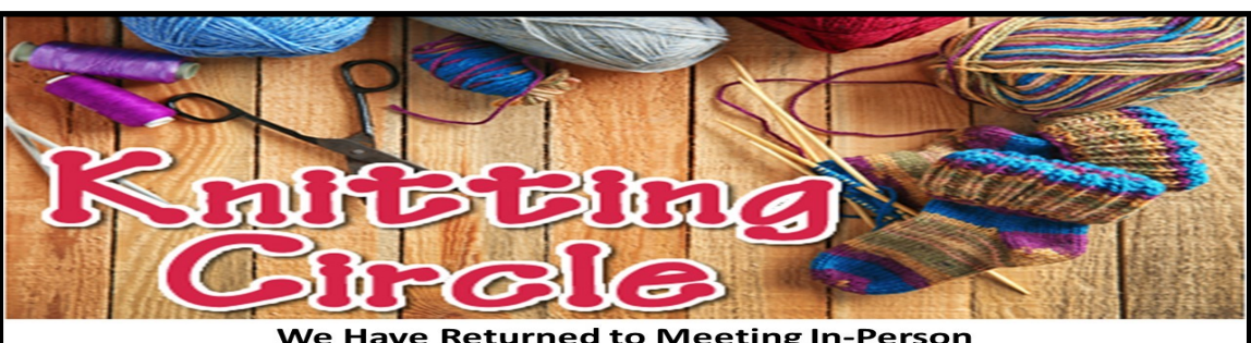
We Have Returned to Meeting In-Person Every Monday at 1:30p.m – 3:30p.m. Come and Join us!

Middle School aged girls Youth Meets Tuesday Evenings 4:30-5:30p.m. Seeks ways to know Jesus Better and to engage in service Christ and Neighbors using their talents, compassion, and love.