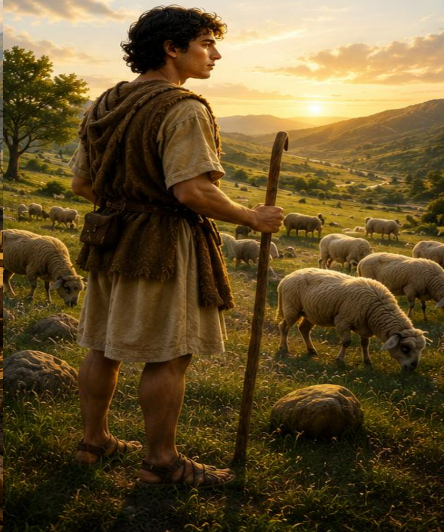
BEFORE DAVID FACED GOLIATH