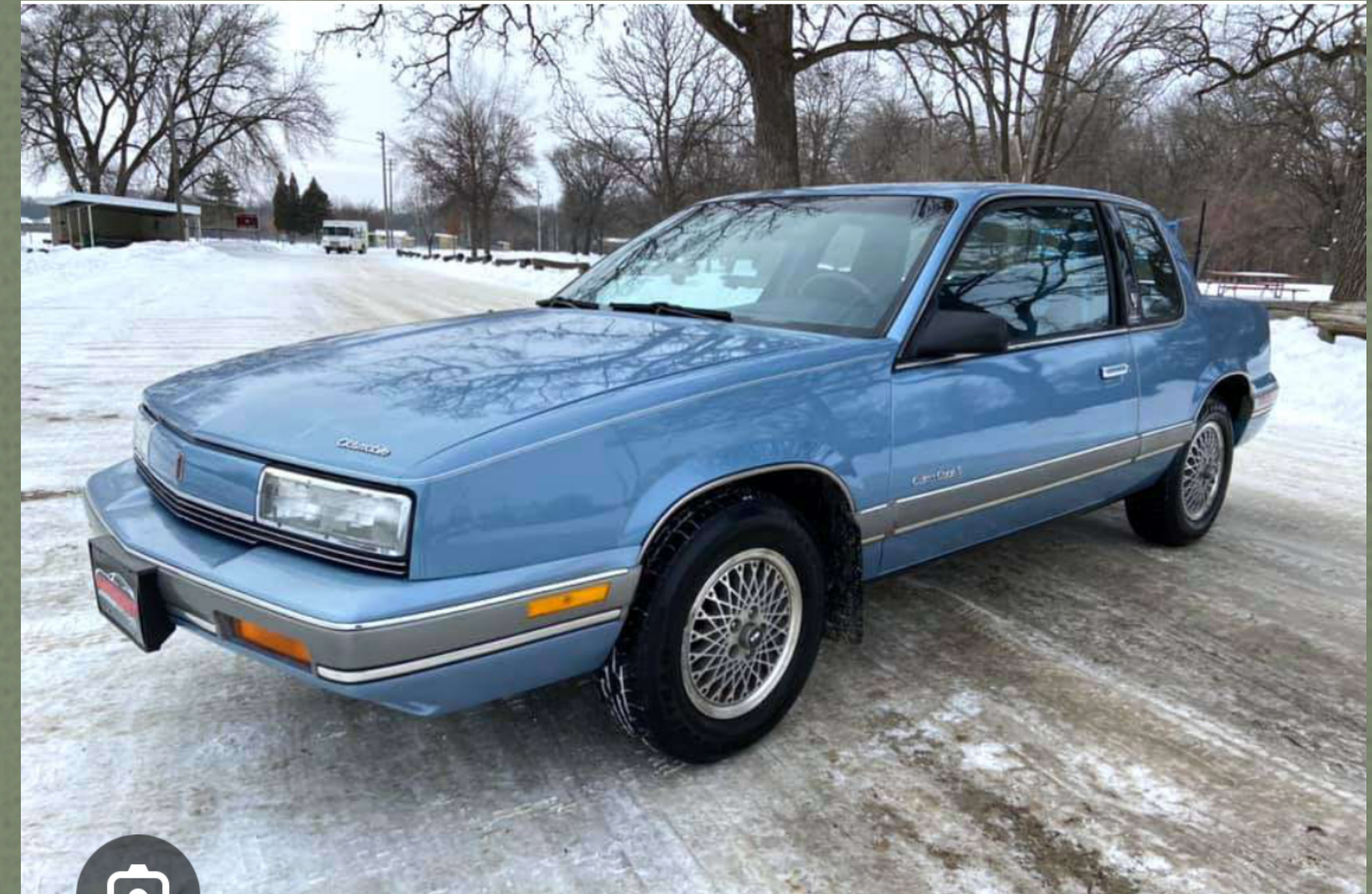
1984 Oldsmobile Cutlass Calais