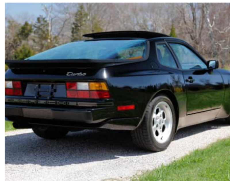
1986 Porsche 944 Turbo