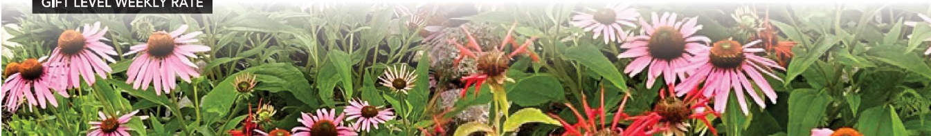
GIFT LEVEL WEEKLY RATE