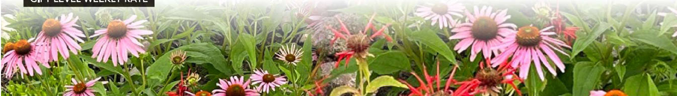
GIFT LEVEL WEEKLY RATE