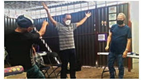
LEFT: A New Hope Trauma Healing group gathers in Guadalajara.