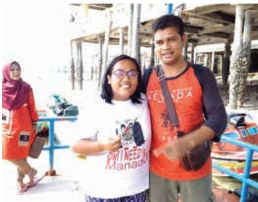
Sending disciples to engage the unreached.

Leaders from across Southeast Asia came together for a Senders’ Training in 2018. Godly men from Singapore and Indonesia realized they could do so much more together: Singapore could undergird the work financially while Indonesia provided the training. Over the next two years, a Singaporean/Indonesian partnership was born.