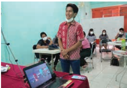
Training and equipping disciples to be sent out.

In 2020, Southeast Asia Prayer Points celebrated the sending of Filipino believers to the nations. This year, God continues to advance globally in creative ways. Even before the idea of “globalization” was coined, Christians have been working toward the fulfillment of the Great Commission. In obedience to Jesus’ command to “go,” countrymen are crossing cultural gaps to share with other countrymen.