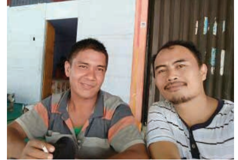
Persons of peace in Southeast Asia

26 EUROPEAN UNENGAGED PEOPLES. The 200,000 Polish in Lithuania are the largest ethnic minority in the country, making up almost 7% of the population. Although 90% profess to be Christian, only 0.3% identify as evangelical. Pray for the Lord to send workers to declare His glory among these people.