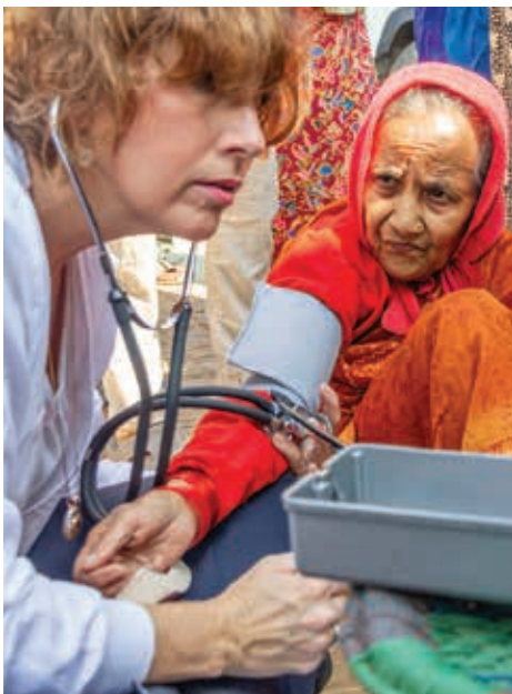
A volunteer nurse checks a woman's blood pressure during a medical exam at a clinic.

A village on the edge of a mega-city was a spiritually hard place, hostile to missionaries and their usual entry approaches. But the village leaders recognized that their people needed good medical care. So they gave permission for healthcare workers to conduct a free medical clinic as long as they did not share the gospel. The clinic event was successful, and the village leaders were honored for making it possible. Based on the trust that they gained through the successful clinic, the healthcare workers were welcomed for follow-up visits in homes where they could pray and share the gospel with people in private. Many were healed of their afflictions and believed in Jesus Christ. A Bible study began in one of the homes, and from that, a small group of believers were discipled and baptized. Thus, a new