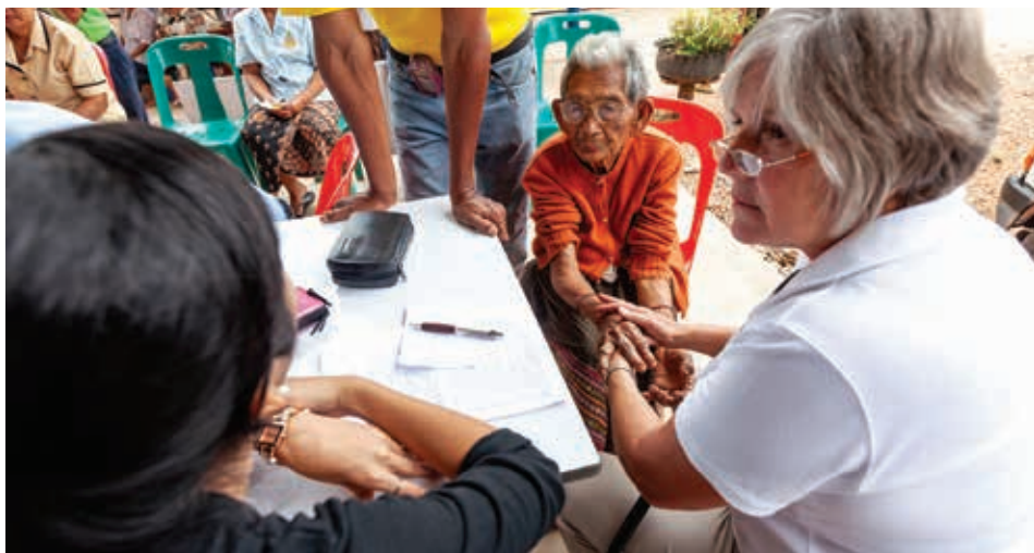
A 97-year old woman in Thailand consults with a volunteer doctor at a mobile medical clinic.

1 EUROPE. People are struggling with depression, anxiety, suicidality, grief, and addiction. Pray for mental health workers to prioritize well and to not be overwhelmed by the needs around them. Pray that support groups will give people hope beyond their circumstances.