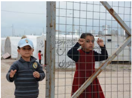
When ISIS attacked Yezidi communities in 2014, many men were killed, and women and girls were sold as slaves. Boys as young as 9 were given military training to serve as ISIS fighters.