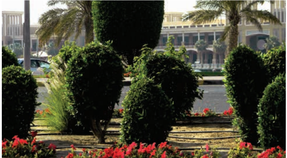
Flowers in Kuwait City

The country of Kuwait, in eastern Arabia at the northern tip of the Persian Gulf, was made famous in western history due to the invasion of Iraq in 1990 and the genesis of Gulf War I in 1991. Since the 1600s, the people of Kuwait City - the capital and largest city - have earned their living as fishermen, pearl divers, tradesmen, shipbuilders, and more recently, as owners of the sixth largest oil reserves in the world. Interestingly, 4 ½ million residents live in Kuwait City, yet only 30% of them are Kuwaitis. They have hired internationals to work in their lucrative oil fields, build grand skyscrapers, and provide service at opulent shopping malls, hotels, and restaurants.