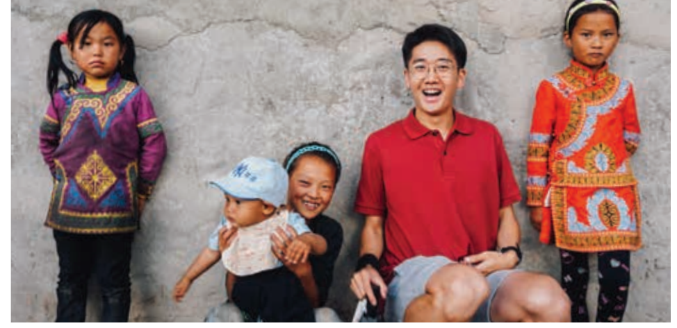
A young man in Korea's "Hands-On" program.

The desire to finish the missionary task is a common call for local pastors; the