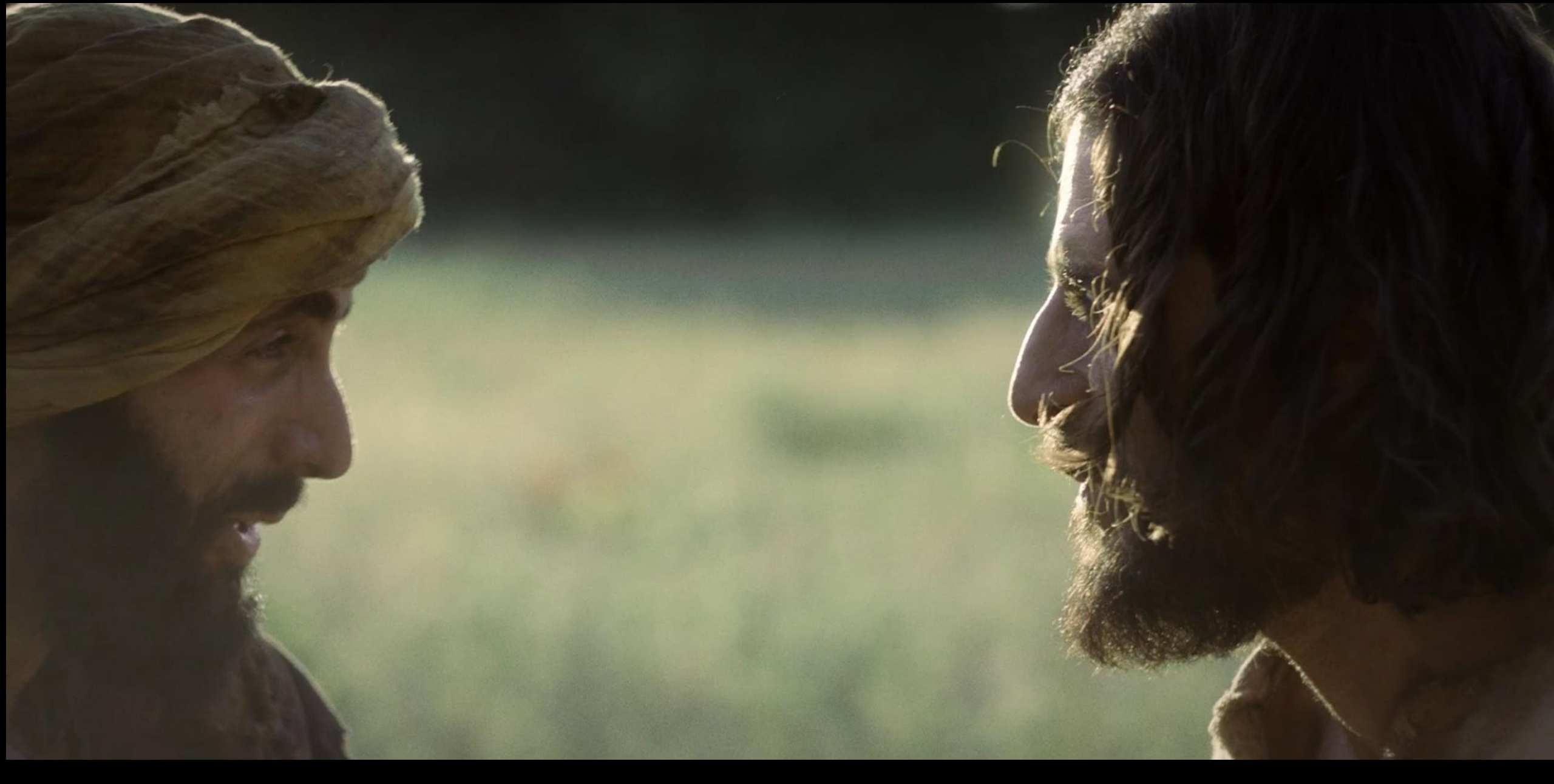
Jesus told the leper NOT to tell ANYONE...