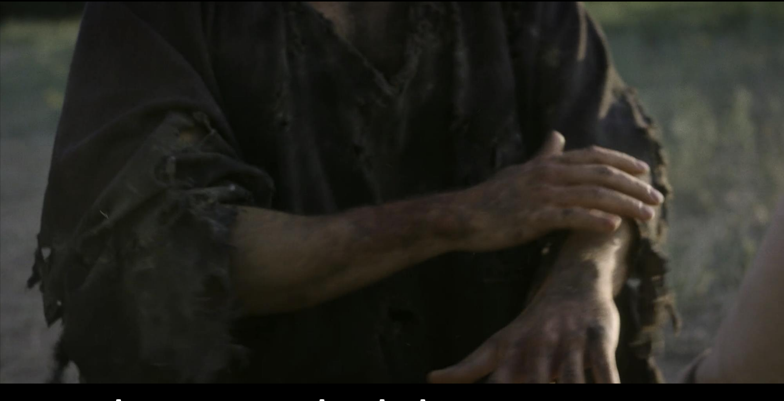
The man was healed IMMEDIATELY...