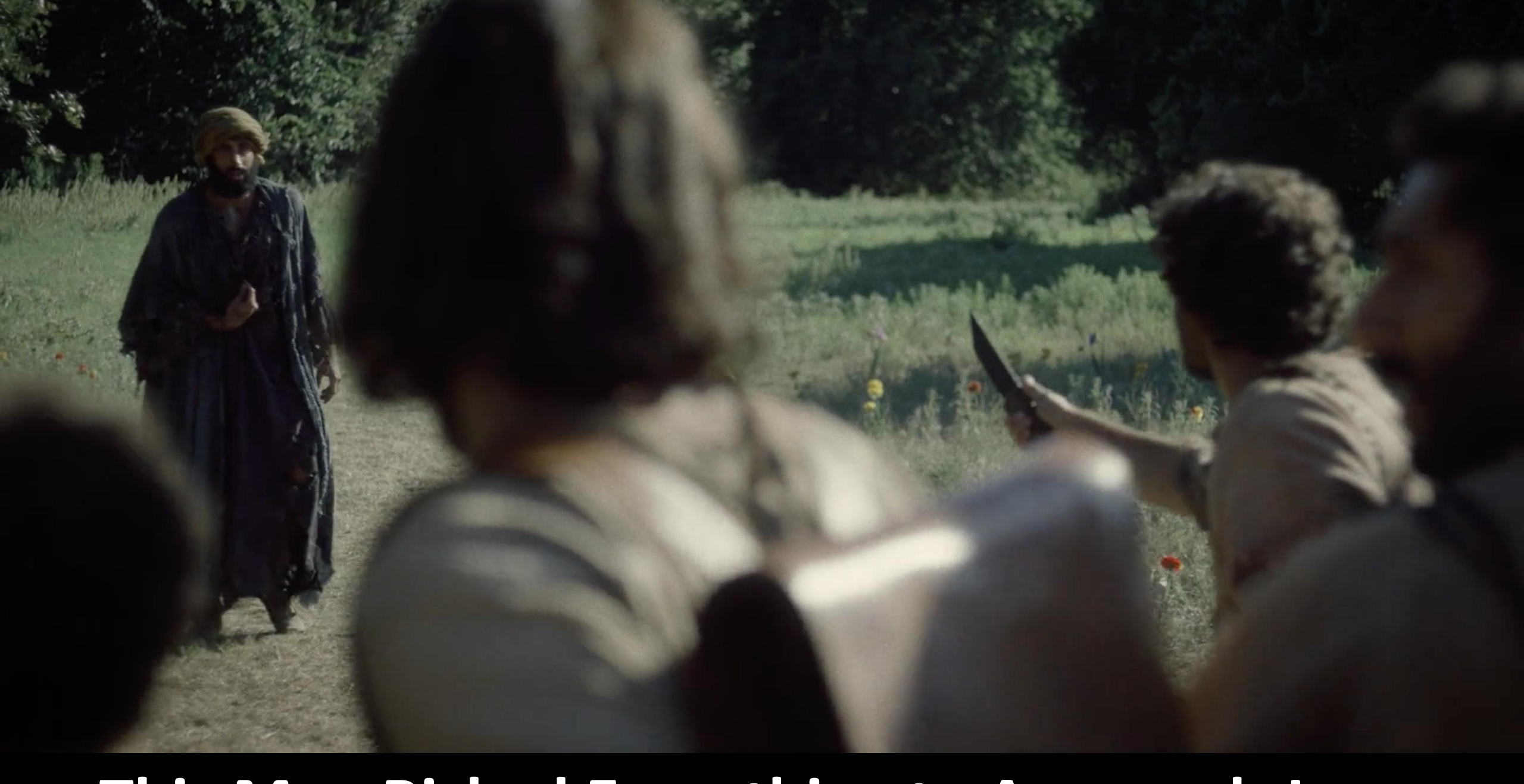
This Man Risked Everything to Approach Jesus