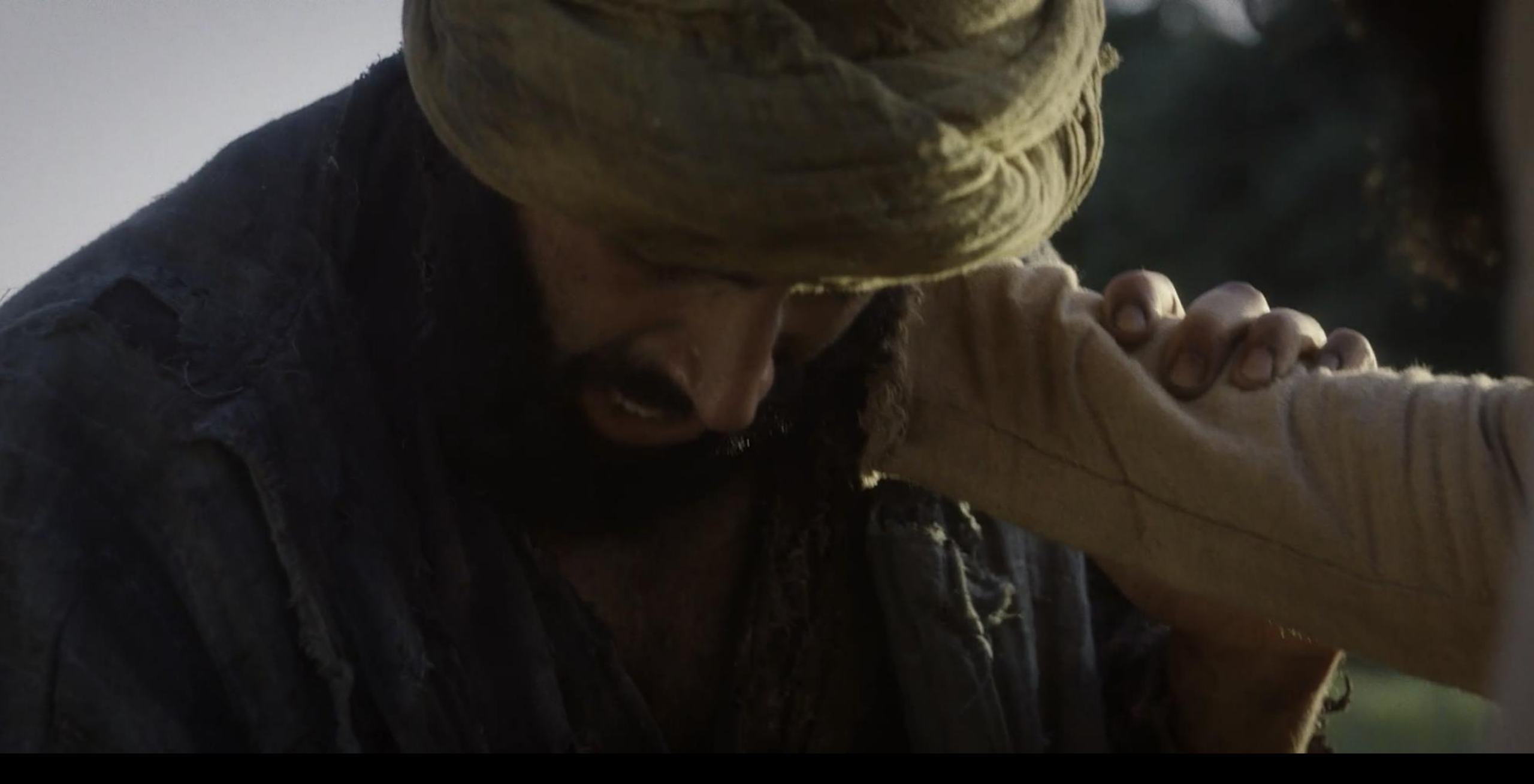
"Jesus stretched out His hand and TOUCHED him..."