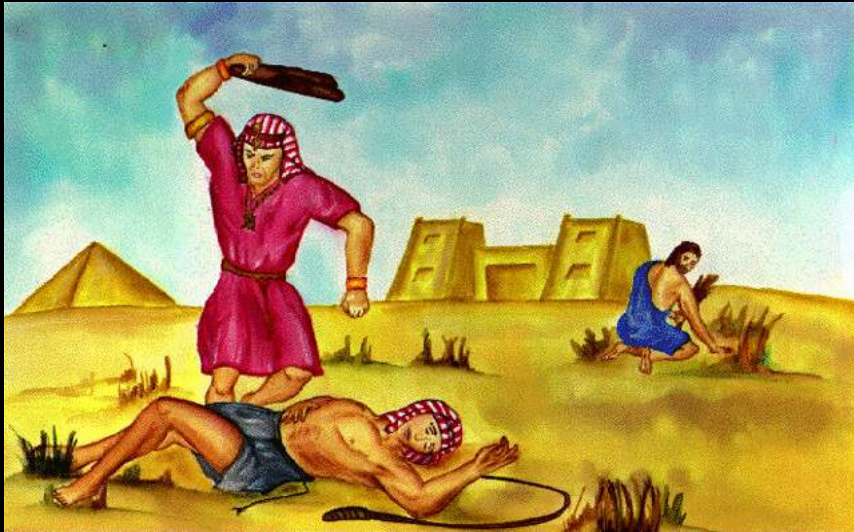
Moses Killed an Egyptian